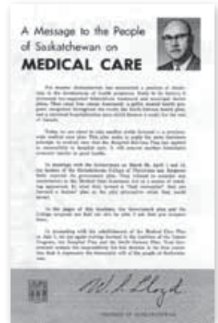
U of S Archives, V.E.A. Tollefson Papers MG26S1, H. Personal

Among the major needs not yet met was injury prevention. Public health nurses and sanitary inspectors were urged to use their enthusiasm, ingenuity and patience in highlighting specific preventable injury hazards during their home visits, bringing them to the attention of homeowners and keeping track of their correction. Mortality due to drowning, motor vehicle crashes and house fires within British Columbia First Nations communities was reported at five times higher than among non-Indigenous people. In 1964, more than 4,600 Canadians were killed in automobile crashes and public attention to and interest in vehicle safety intensified after American consumer advocate Ralph Nader published Unsafe at Any Speed in 1965, documenting the resistance of car manufacturers to address occupant safety issues. 6