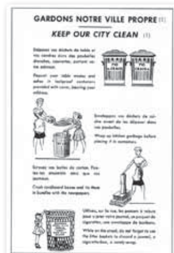
Sandoz Pasteur Limited, Connaught Campus, Archives

Public Health circular distributed to homes, 1961, Vol. 47, No. 1, p. 16