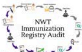
Figure 2: Process of auditing the existing NWT Immunization Registry